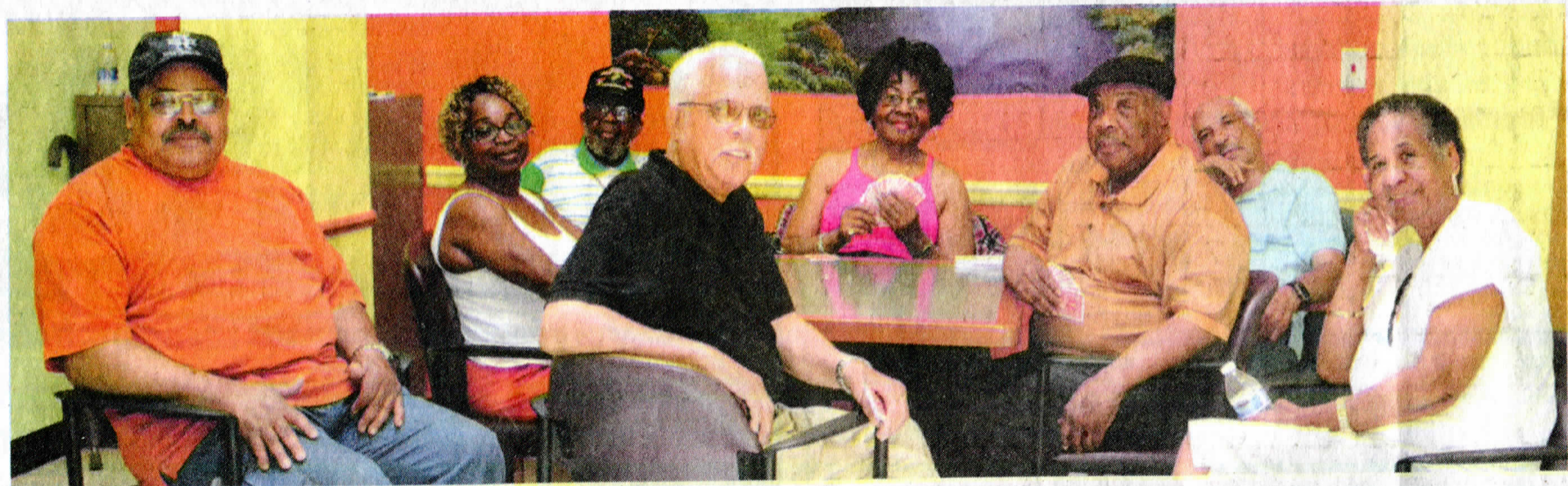
This group says they play cards every day, whether it's Pinochle or Bid Whist.