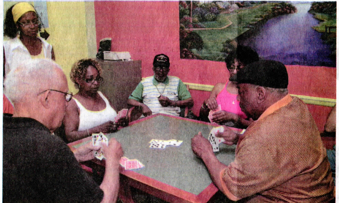
Bid Whist, which is played similarly to Bridge, has a loyal following.