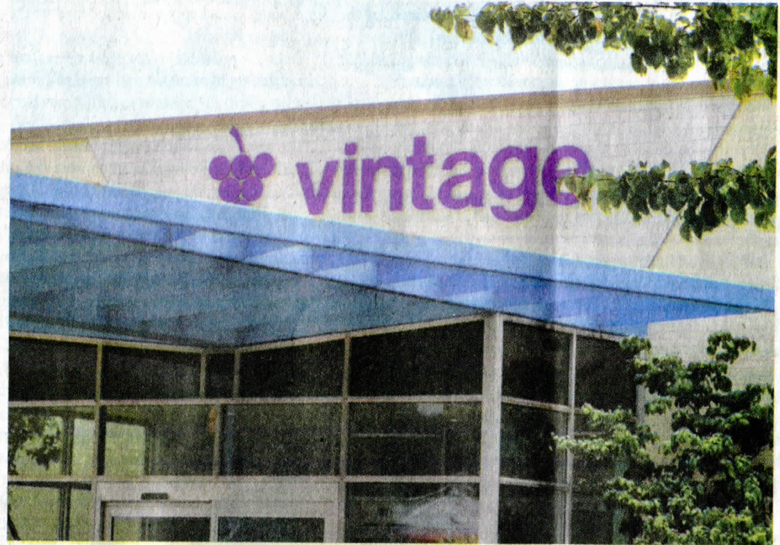
Vintage is one of only two facilities in Western Pennsylvania to be accredited by the National Institute of Senior Centers.

“At my age you gotta keep moving,” she says. “They have good activities and good members here. It’s the best.”